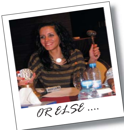
OR ELSE ....