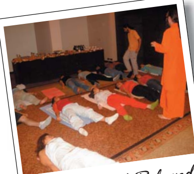
Drop Dead Relaxed