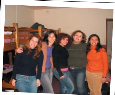
Rac Beirut Girls!!